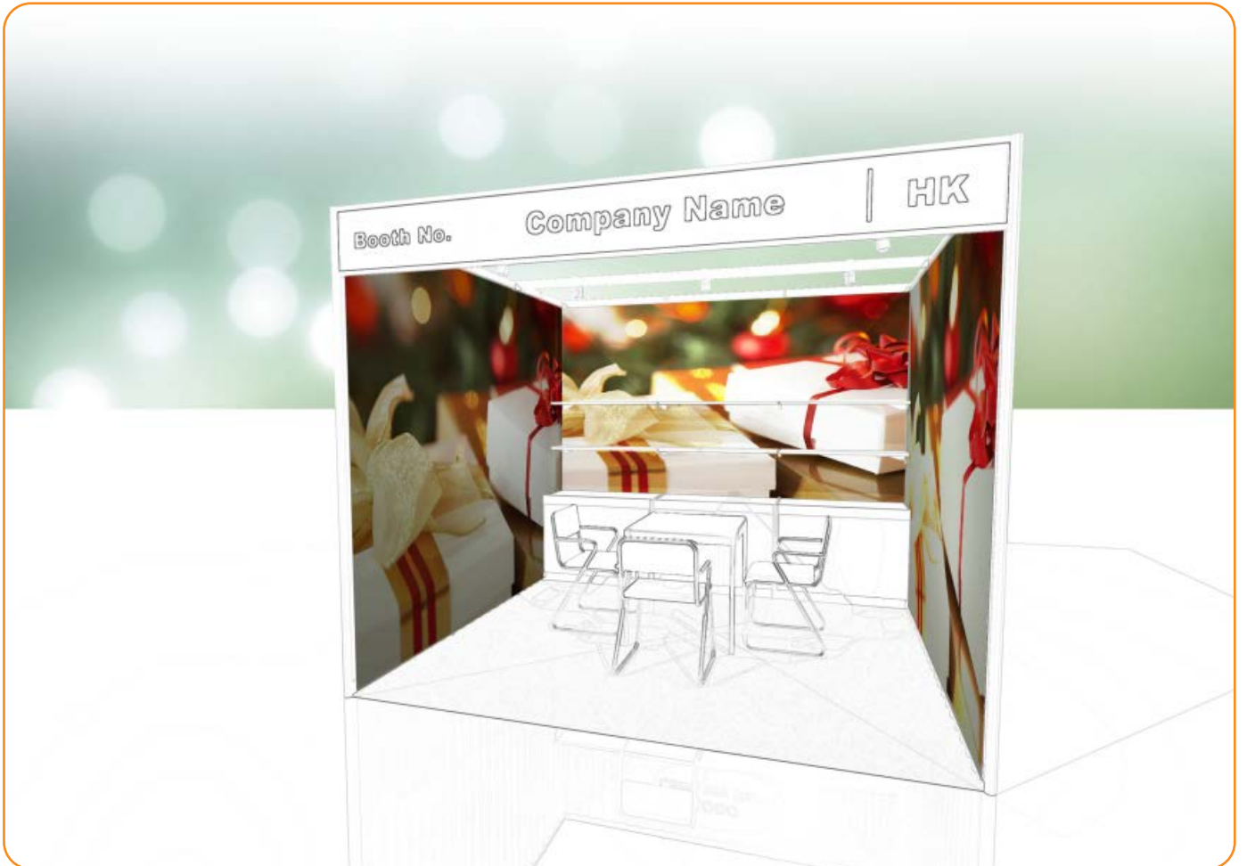
The color of company fascia and carpet will be remained the same as the original booth package. Company fascia color cannot be changed.